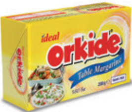
200 g Table Margarine