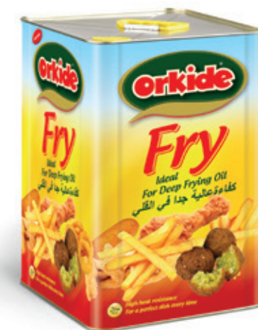
16 kg Orkide Fry For Deep Frying Oil Tin