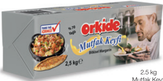
2.5 kg Mutfak Keyfi Block Margarine