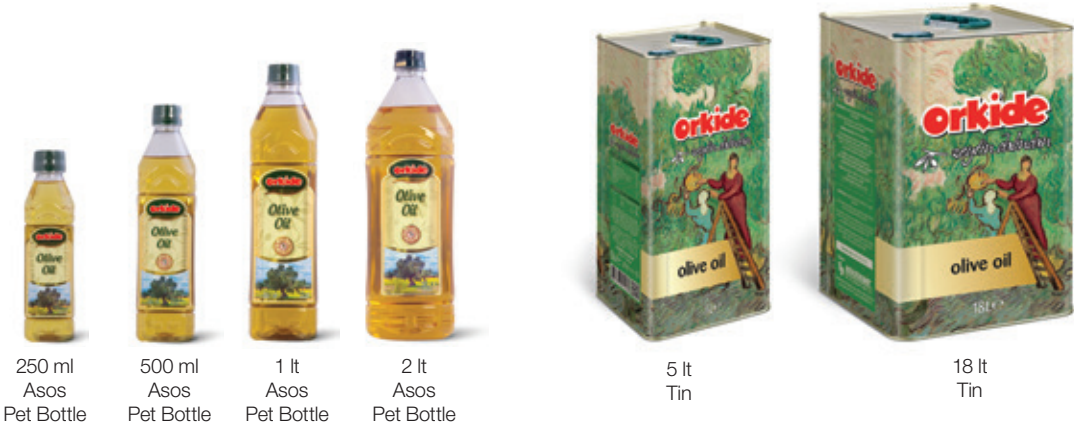
250 ml Asos Pet Bottle