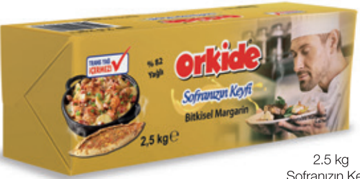
2.5 kg Sofranızın Keyfi Block Margarine