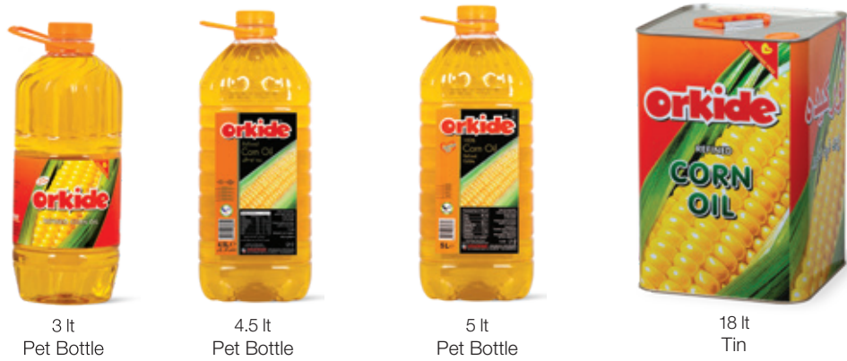
3 lt Pet Bottle 4.5 lt Pet Bottle 5 lt Pet Bottle 18 lt Tin