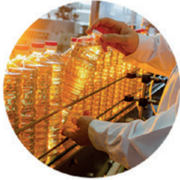
KUCUKBAY OIL AND DETERGENT INC. OLIVE OIL FACTORY Bornova (Izmir)

A TALE OF FLAVOUR FROM THE KITCHENS OF TURKEY TO THE KITCHENS OF THE WORLD