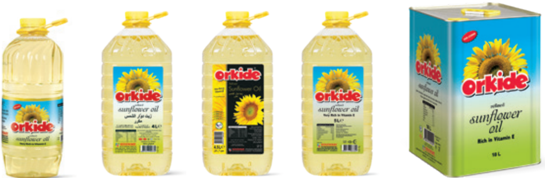
3 lt Pet Bottle 4 lt Pet Bottle 4.5 lt Pet Bottle 5 lt Pet Bottle 18 lt Tin