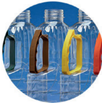
PAPIX PLASTICS INC. Çiğli (Izmir)