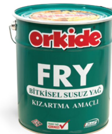
18 Lt Fry Round Tin