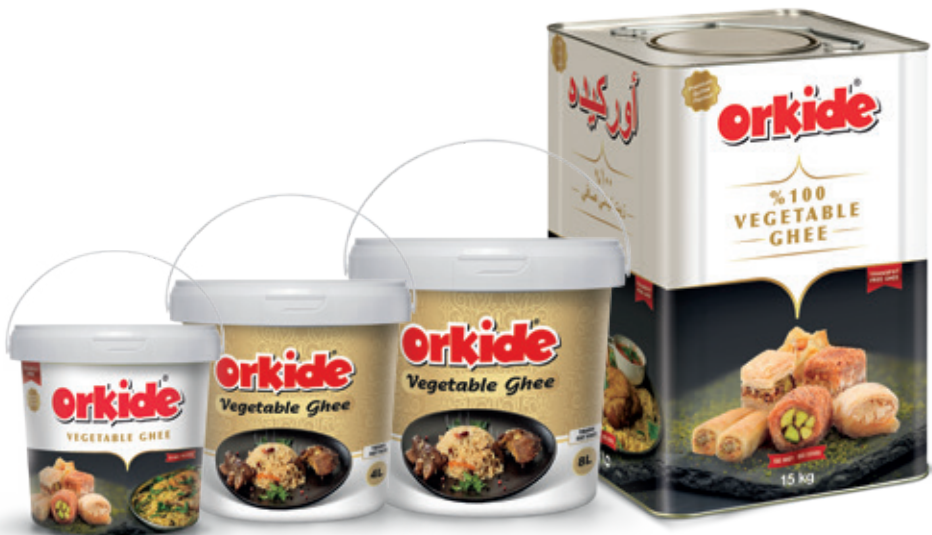
950 g Vegetable Ghee Bucket

Store in a cool, dry and odourless place.