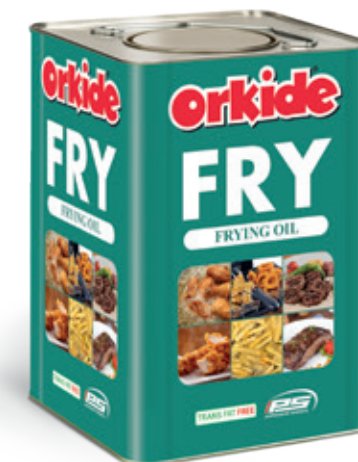
18 Lt Fry Square Tin

Use by opening the plastic cap without puncturing the packaging, close the cap after use. Keep out of the sun, store in a cool place and make sure water doesn't get in the canister.