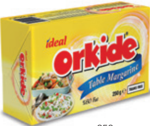
250 g Table Margarine