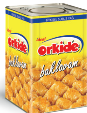
18 Lt Baklavam Square Tin