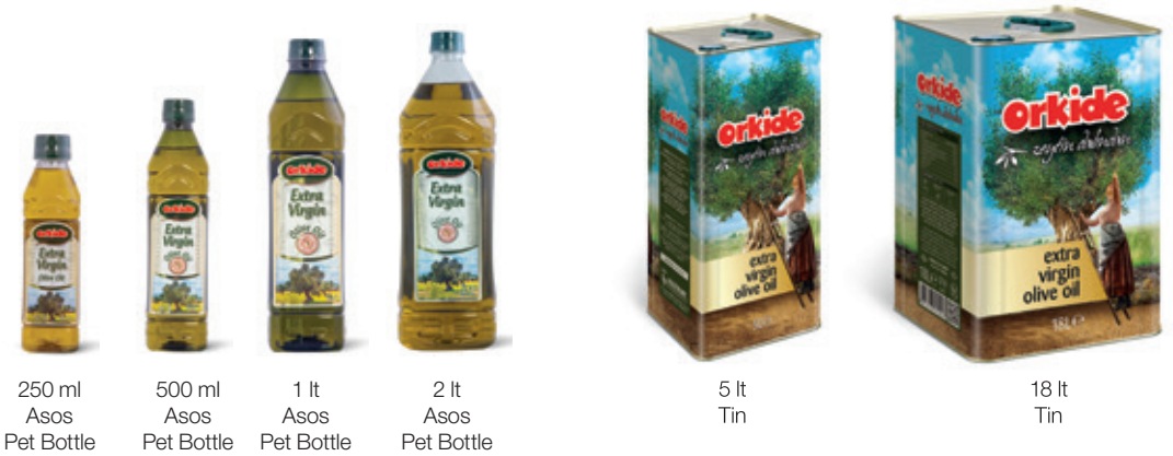
250 ml Asos Pet Bottle 500 ml Asos Pet Bottle 1 lt Asos Pet Bottle 2 lt Asos Pet Bottle 5 lt Tin 18 lt Tin