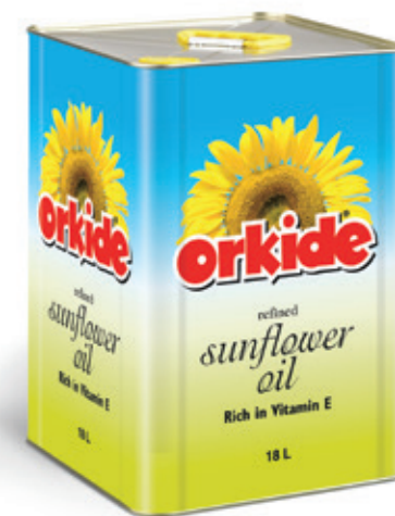
18 lt Orkide Sunflower Oil Tin

Use by opening the plastic cap without puncturing the packaging, close the cap after use. Keep out of the sun, store in a cool place and make sure water doesn't get in the canister.