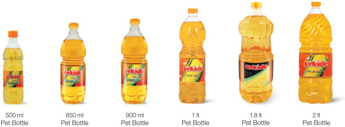
500 ml Pet Bottle 850 ml Pet Bottle 900 ml Pet Bottle 1 lt Pet Bottle 1.8 lt Pet Bottle 2 lt Pet Bottle