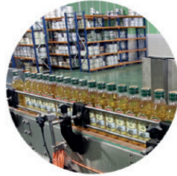
OLIVE OIL FACTORY Çiğli (Izmir)