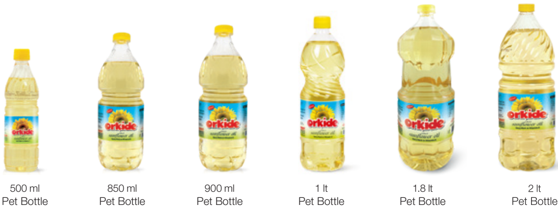
500 ml Pet Bottle 850 ml Pet Bottle 900 ml Pet Bottle 1 lt Pet Bottle 1.8 lt Pet Bottle 2 lt Pet Bottle