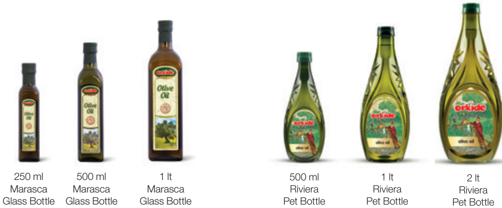
250 ml Marasca Glass Bottle