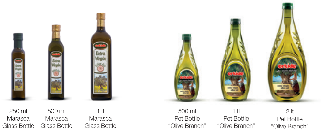
250 ml Marasca Glass Bottle 500 ml Marasca Glass Bottle 1 lt Marasca Glass Bottle 500 ml Pet Bottle "Olive Branch" 1 lt Pet Bottle "Olive Branch" 2 lt Pet Bottle "Olive Branch"