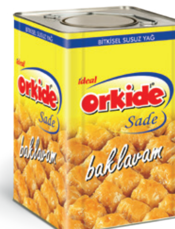
18 Lt Baklavam Sade Square Tin